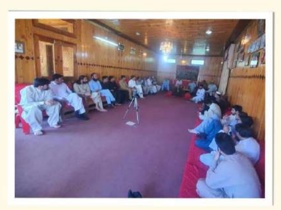
Interaction with activists' delegations from different Tehsils of Swat & Shangla